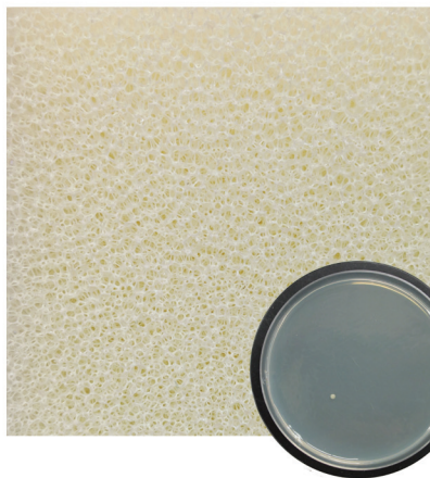
Treated with Ultra-Fresh®