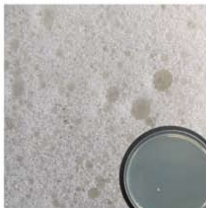
Treated with Ultra-Fresh®