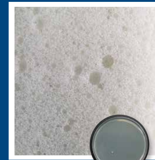
Treated with Ultra-Fresh®