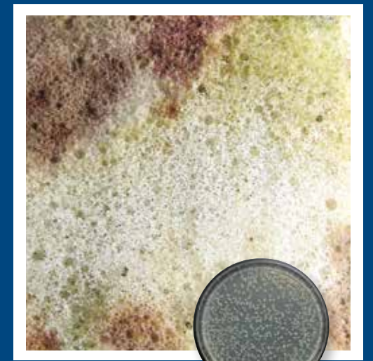
Regular untreated foam

Foam treated with Ultra-Fresh® antimicrobial technology has 99.9% fewer bacteria compared to untreated foam. Ultra-Fresh® is a registered trademark of Thomson Research Associates, Inc.